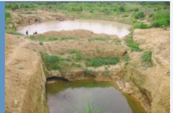
Middle and below: Talama kimberlite dyke exposed in hillside workings. Right: View of Pandubo possible kimberlite ‘blow’ with dyke extension in the foreground. Photo looking southwest.

As part of the joint venture agreement with African Precious Mineral, River Diamonds will manage the exploration programme.